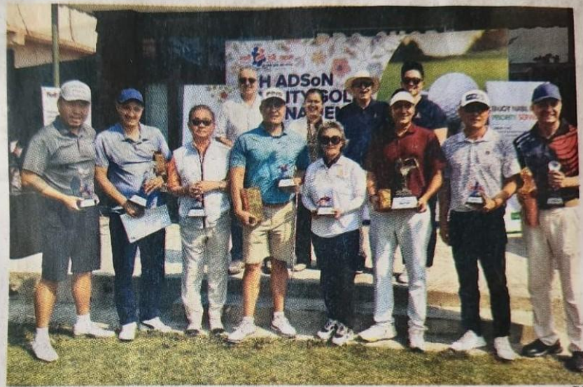
Winners of the ninth ADSoN Charity Golf Tournament pose for a group photo at the Gokarna Golf Club in Kathmandu on Saturday.